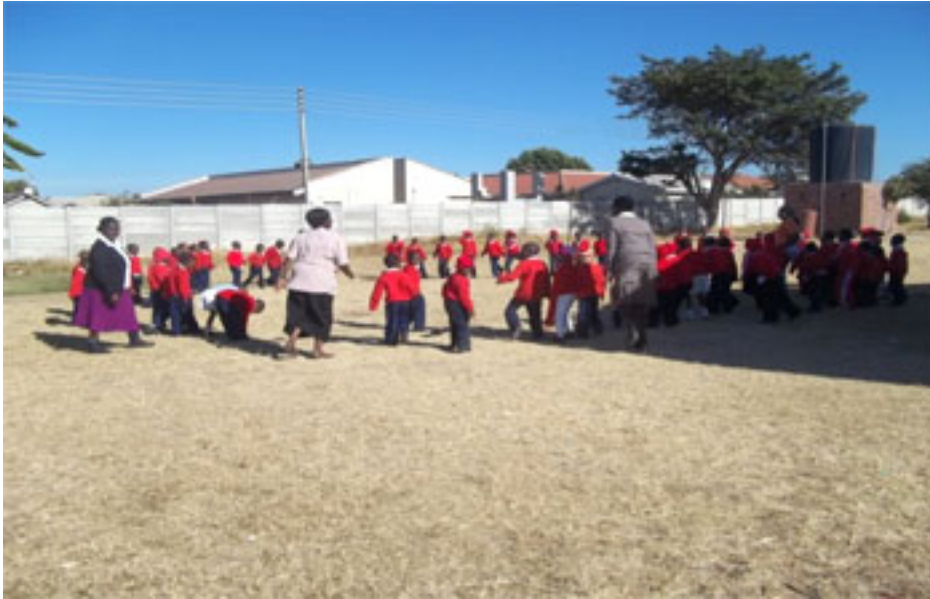
ECD BALLET CLUB