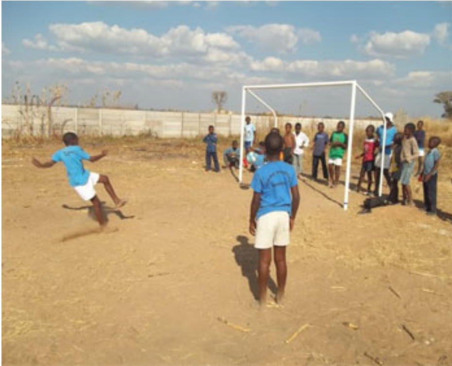
SOCCKER JUNIOR TEAM