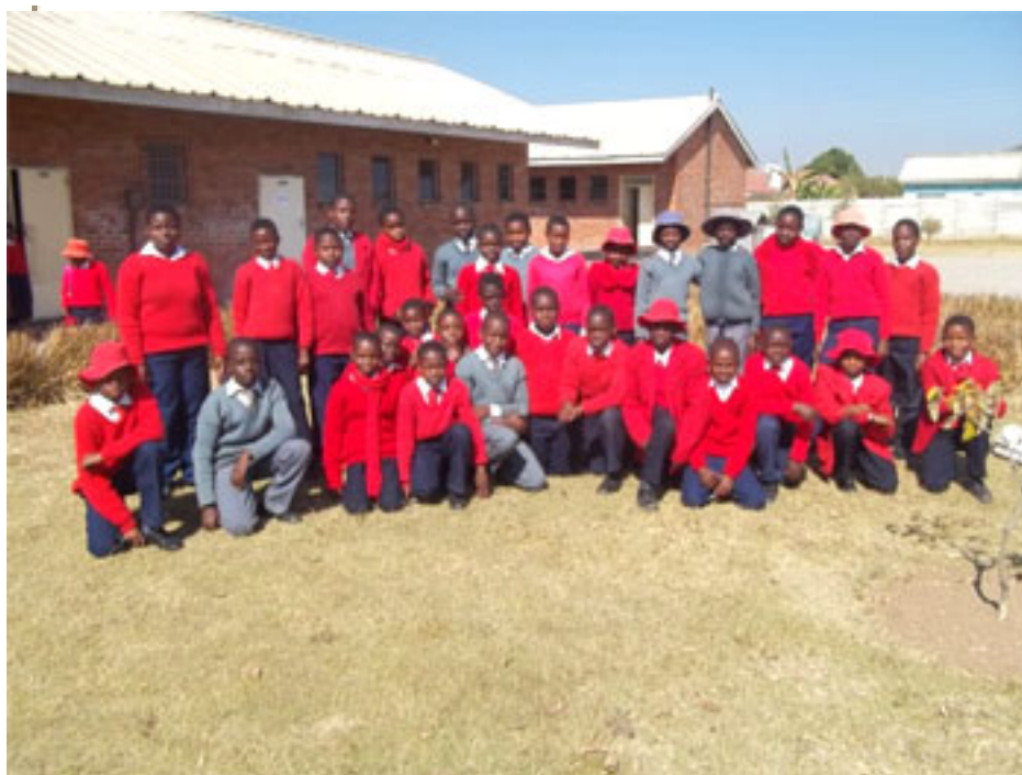
TABLE TENNIS TEAM