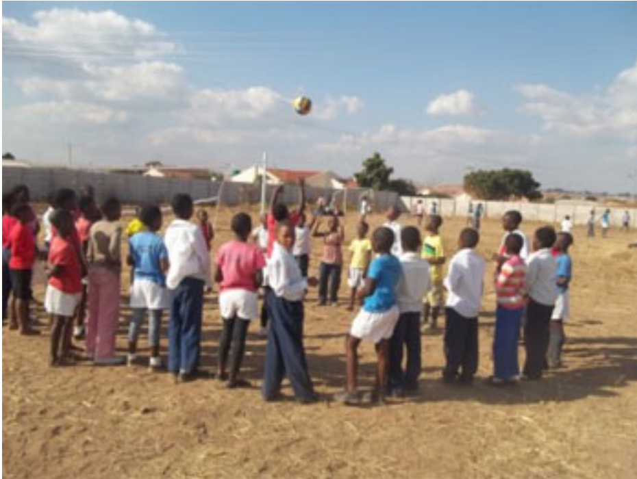
VOLLEYBALL JUNIOR TEAM